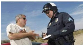
Police: Why Didn't you report your stolen credit card? Man: The thief was spending less than my wife